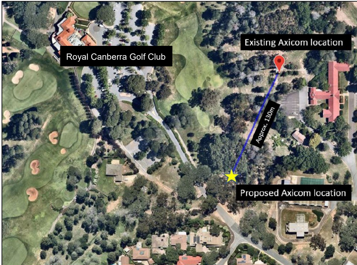
Figure 1. Locations of the existing and proposed Indara telecommunications facilities

Confirmation of the specific location of the proposed replacement facility (with regard to the existing facility and the Golf Club) is provided in Figure 1 .