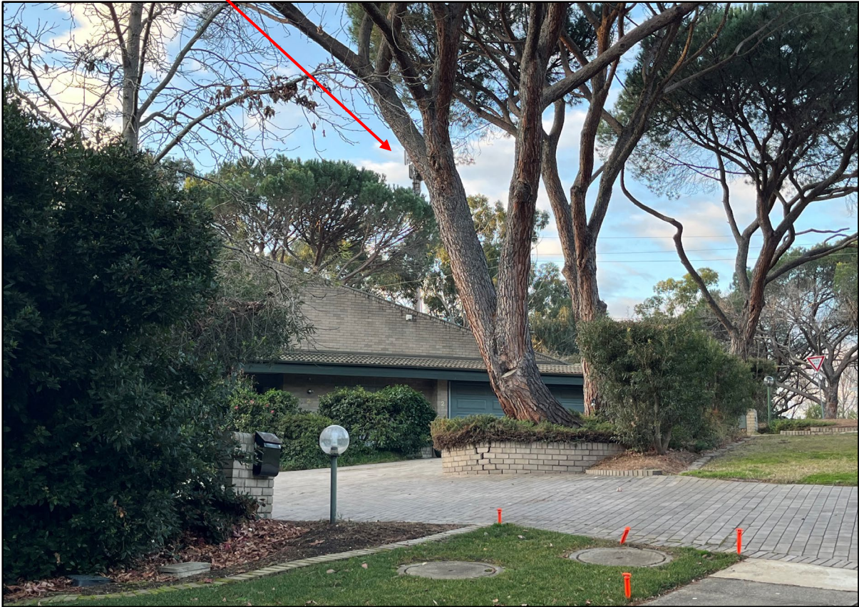
Figure 6. View from Lane-Poole Place. NB - the Indara structure is visible only above the tree tops

As the photomontages indicate, the proposed facility would be significantly screened from the surrounding residential areas because of the tall mature trees.