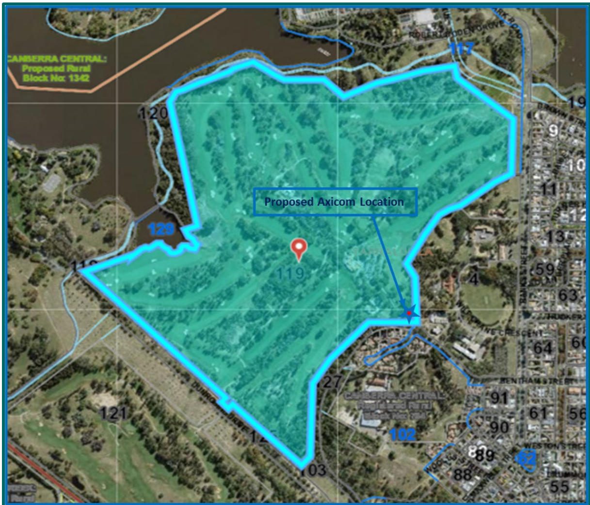
Figure 2. Extent of Royal Canberra Golf Club

The Royal Canberra Golf Club manages extensive grounds for use by Golf Club members and visitors. As can be seen in the photo below (please refer to Figure 2 ), the grounds extend all the way to the Molonglo River.