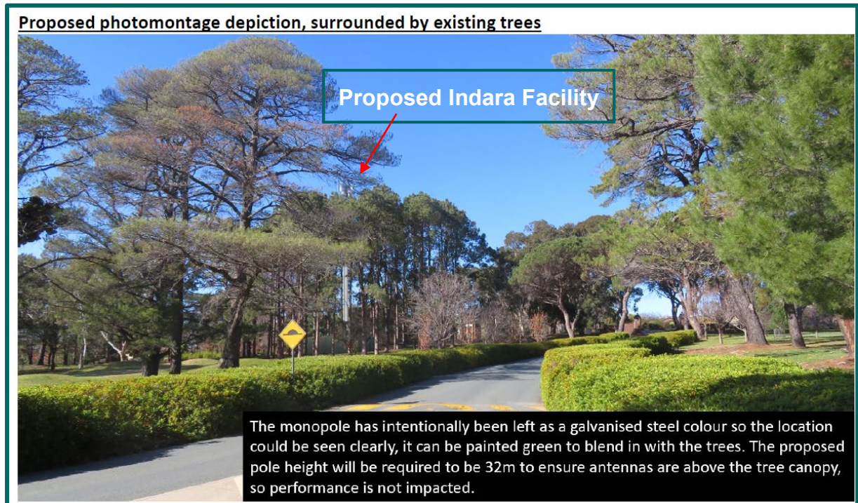
Figure 3. Photomontage showing the location within the group of trees (photo taken from the Golf Club gate)

Indara is conscious of limiting the visual impact of the proposal. After much discussion with the Management of the Club, the site at the entrance to the Club was selected. A photomontage of the proposed facility is provided (please refer to Figure 3 ) - showing that the selected site is very favourable as a location.