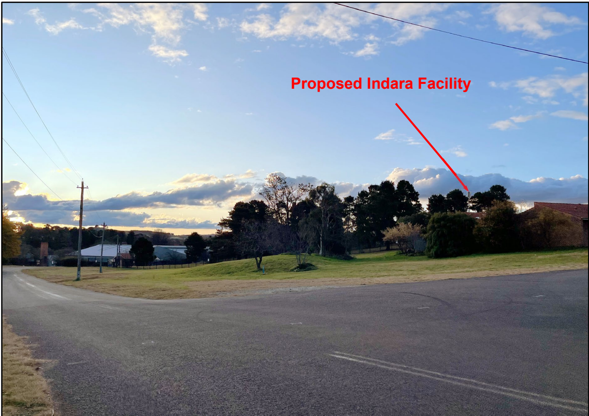
Figure 4. View from Bentham Street, looking north-west towards the Golf Course Clubhouse